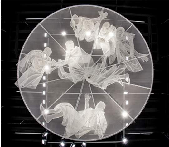
Recycle Group, Dome , 2015.