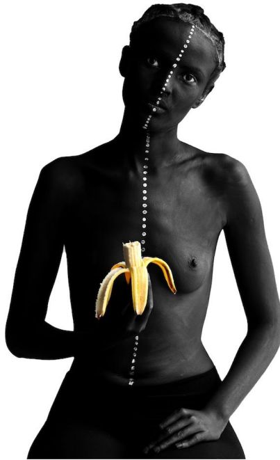
Aida Muluneh – The Wolf You Feed 3, 2014

"Guess Who's Coming to Dinner?" runs through August 23 at the Richard Taittinger Gallery, 154 Ludlow St.