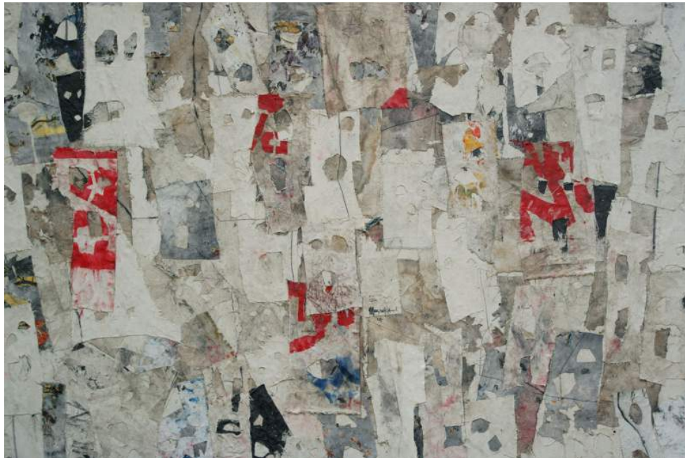
Uche Uzorka, Also Known as No Place Like Home (Tear and Wear) (2015).