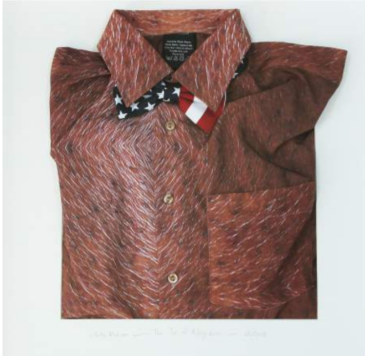
Chika Modum, The Tie of Allegiance (2015).