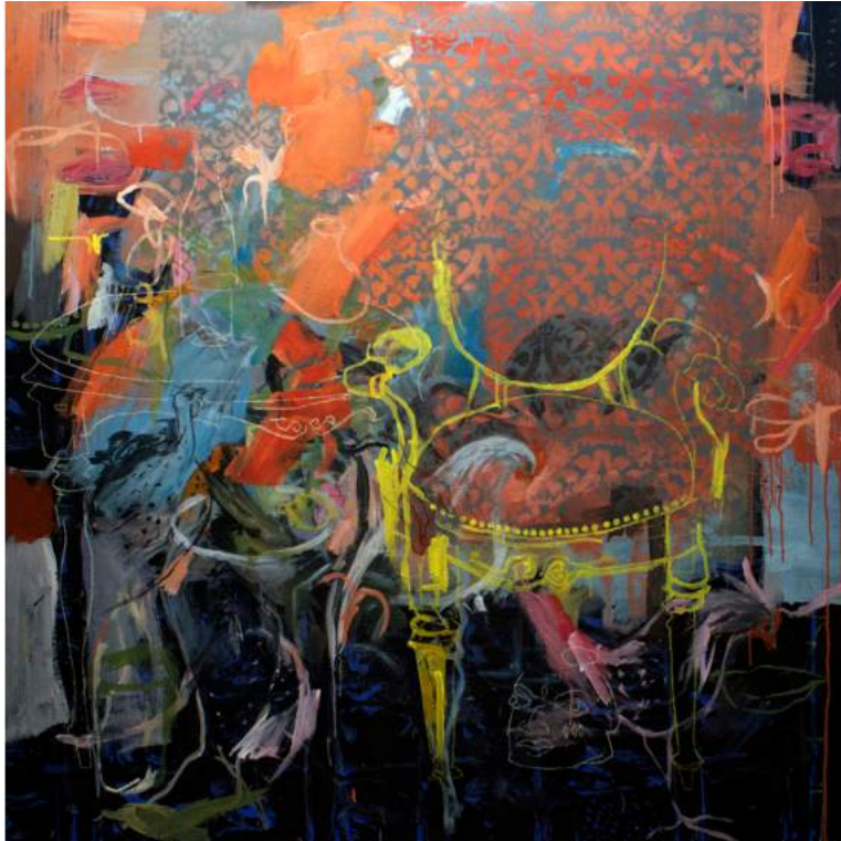
Gopal Dagnogo, End of an Era N°4 (2014).