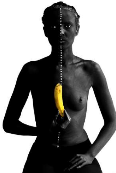
Aida Muluneh, The Wolf You Feed 1 (2014).