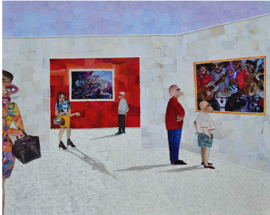
Chike Obeagu, Private Viewing (2015).