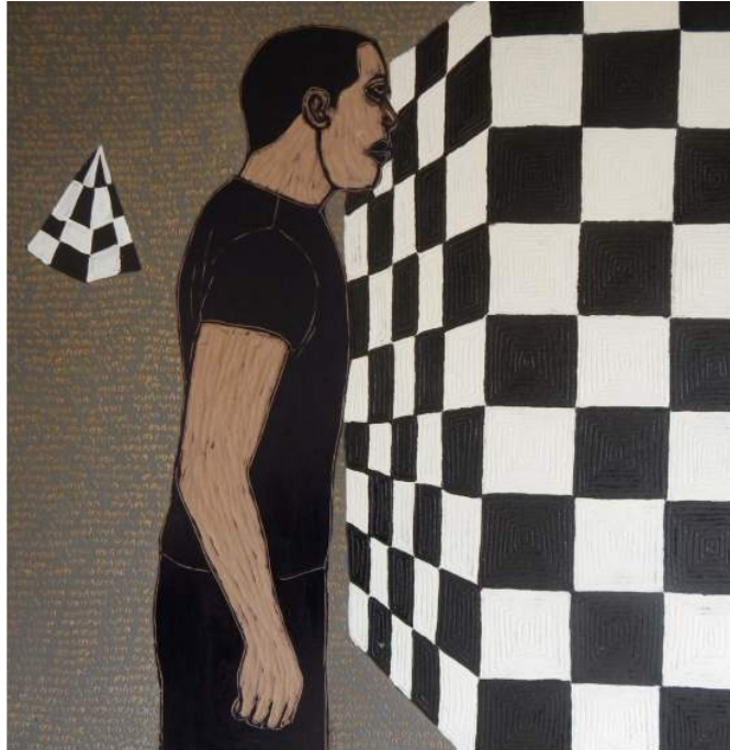
Ephrem Solomon, Untitled from the series Forbidden Fruit (2014).