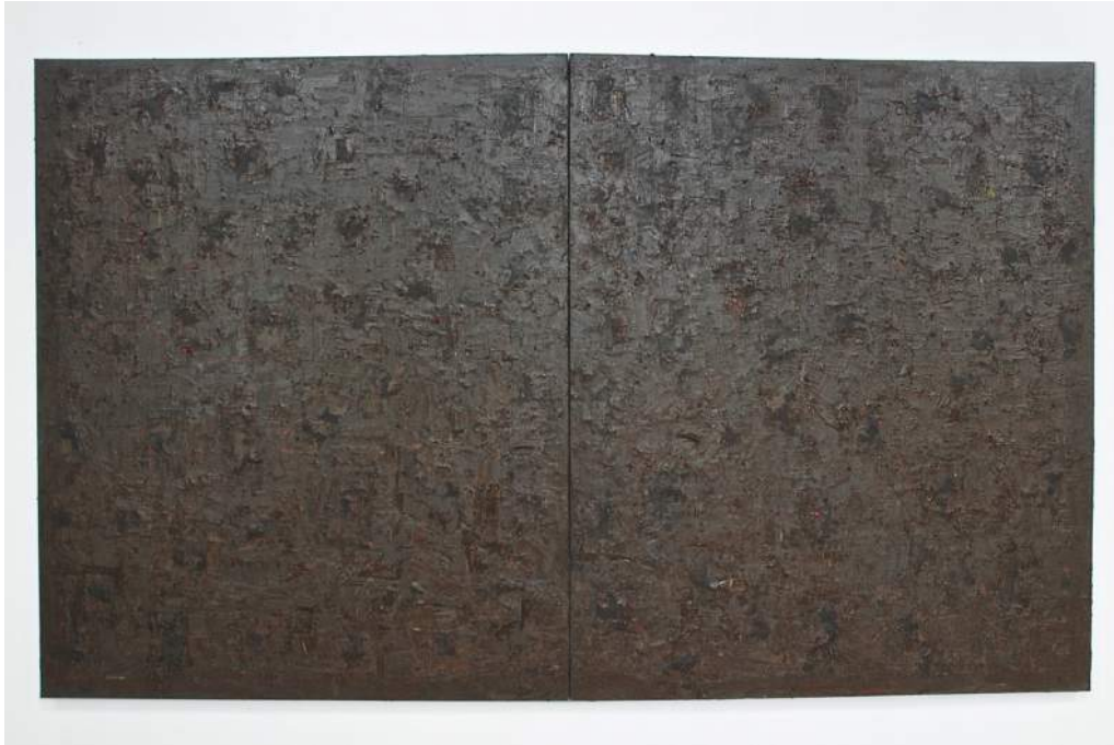
Onyeka Ibe, Double Walls (2015).