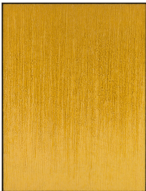
Resonance , 2015. Steel, beeswax on wood panel 72.75 x 50.75 in. (184.8 x 128.9 cm).