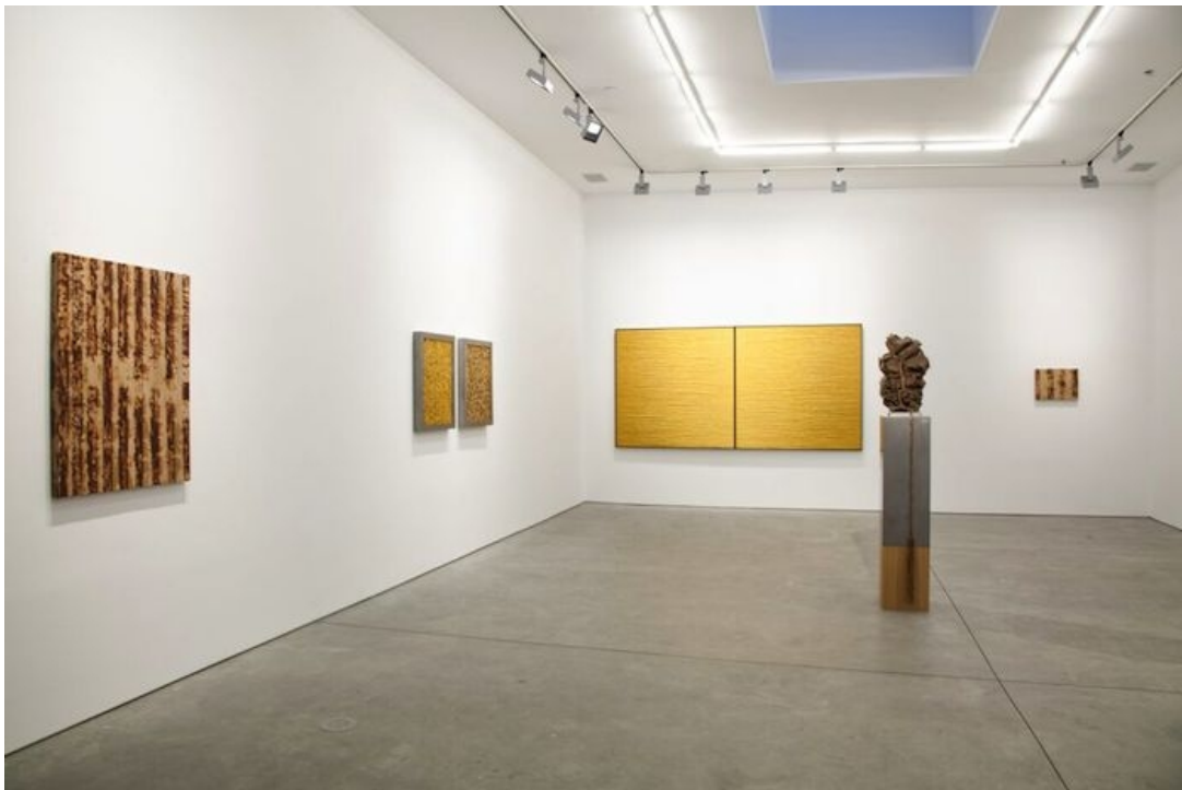
(Photo : Courtesy of Richard Taittinger Gallery - Nick Theobald "WITH HONEY FROM THE ROCK")