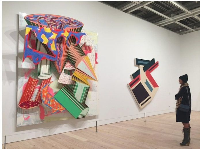
(Photo : Design & Trend - Meg Busacca - Frank Stella's "A Retrospective")

"Frank Stella: A Retrospective" consists of nearly 100 works, including paintings, sculptures, drawings, reliefs and maquettes. The entire fifth floor of the Whitney museum is filled with uplifting colors, patterns and mixed materials — truly an inspirational experience.