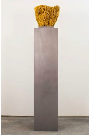
(Photo : Courtesy of Richard Taittinger Gallery - Nick Theobald "WITH HONEY FROM THE ROCK")

The installation will continue through Dec. 12.