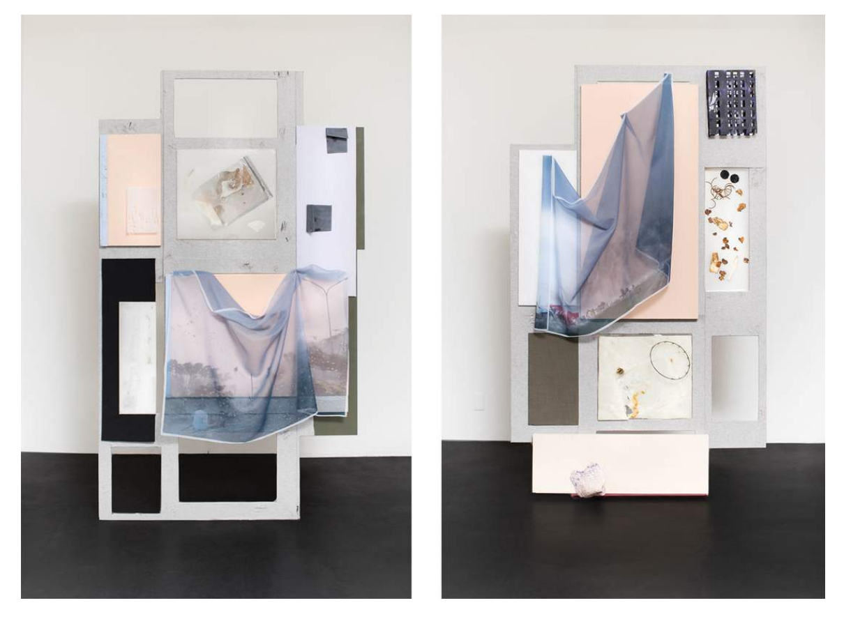
Left: Olivia Erlanger, Suspicious Partner Facade , 2016. Right: Olivia Erlanger, Urchin Crown Facade , 2016.

The New York artist shows sculptural works reminiscent of building facades, but instead of windows and doors we find sheets of fabric, a chess board, or an exit sign accented with bits of porcelain, honeycomb, and