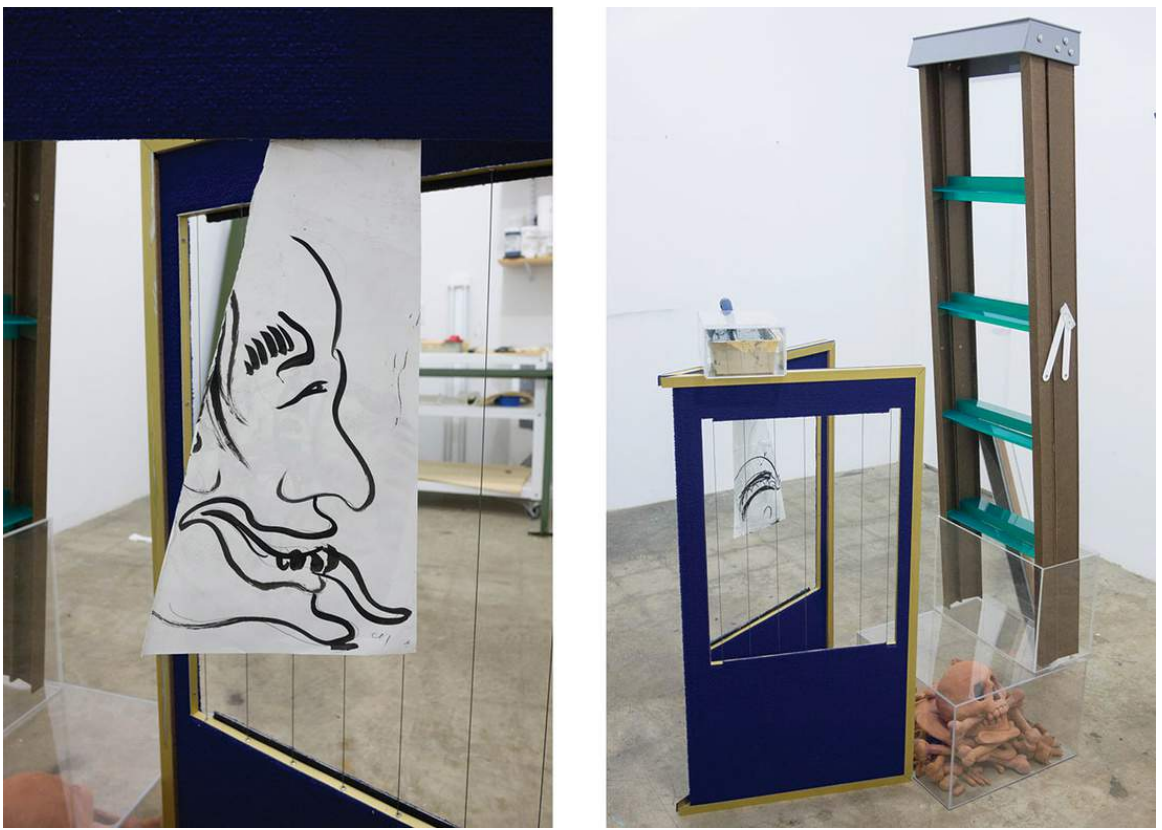
Lukas Geronimas, Untitled Work, 2016.

The Canadian artist's works are as much about drawing and sculpture as the frames, boxes, and other custom elements through which they are presented. Among various series on view are works made from the dust in his Los Angeles studio, collected from a vacuum cleaner and mounted on custom plexi frames; drawings scrawled with every color in a box of pastels; and ink and graphite polychromed sculptures that are intricately carved and made to resemble paint cans.