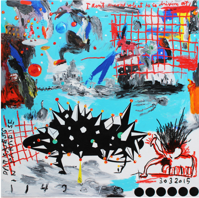
Darkness in Paradise , 2012, Mixed Media on canvas, 63 x 63 in. (160 x 160 cm.)

RICHARD TAITTINGER GALLERY is proud to announce the U.S. representation of the world-renowned Japanese artist, Aki Kuroda (b. 1944), and to present his first NYC solo exhibition, Happy Boy in Manhattan . His works are in collections such as The National Museum of Modern Art in Tokyo, the City of Paris Collection, and the Marguerite and Aimé Maeght Foundation in France. Bucking traditional hierarchy Kuroda was also the youngest artist to have solo exhibition at Tokyo's National Museum of Modern Art in 1993. Happy Boy in Manhattan is curated by Yoyo Maeght whose friendship with Kuroda has lasted 40 years since the time of Kuroda's first exhibition in France, Les tenebres , at Galerie Maeght in 1980.