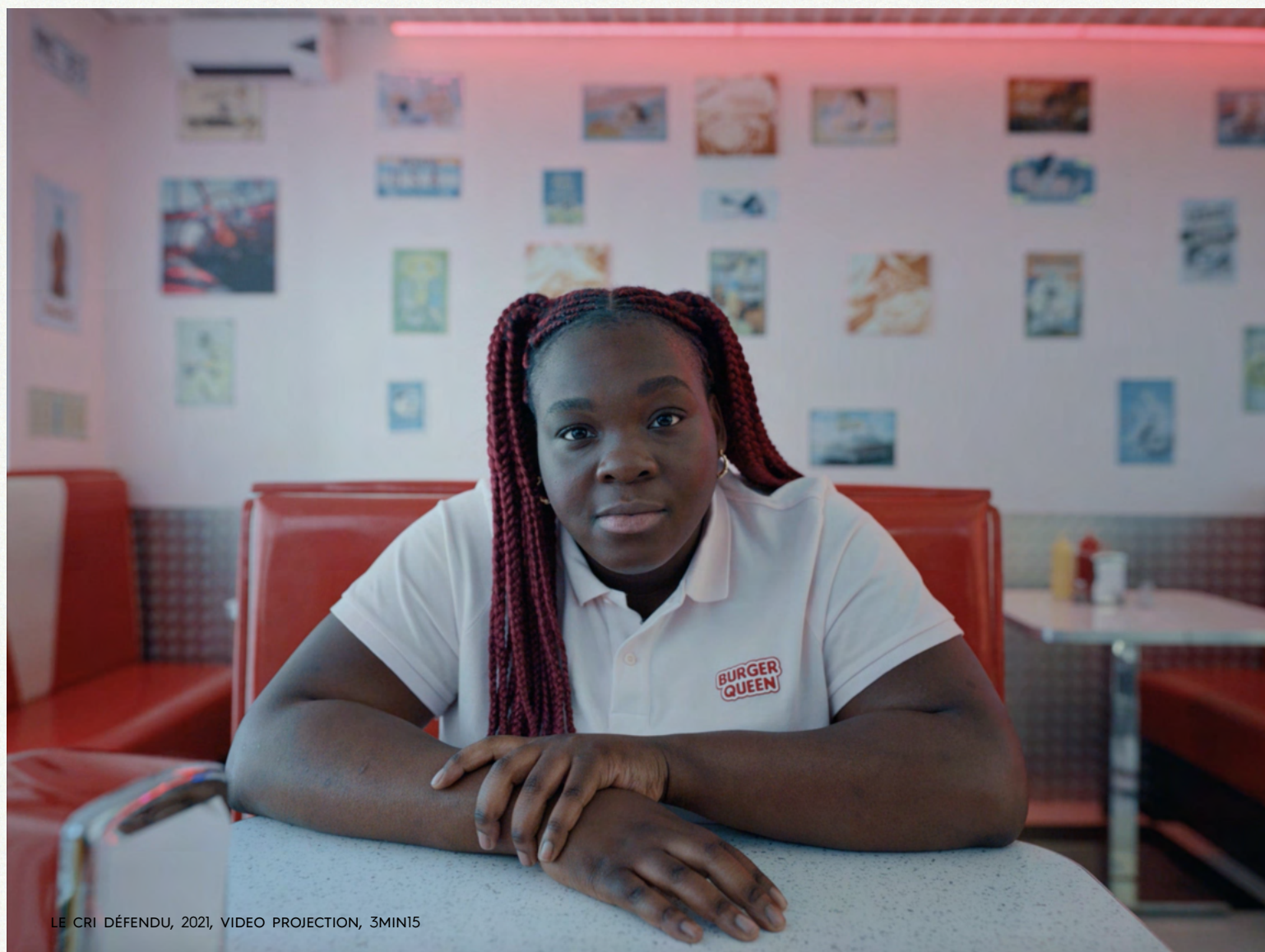
LE CRI DÉFENDU, 2021, VIDEO PROJECTION, 3MIN15