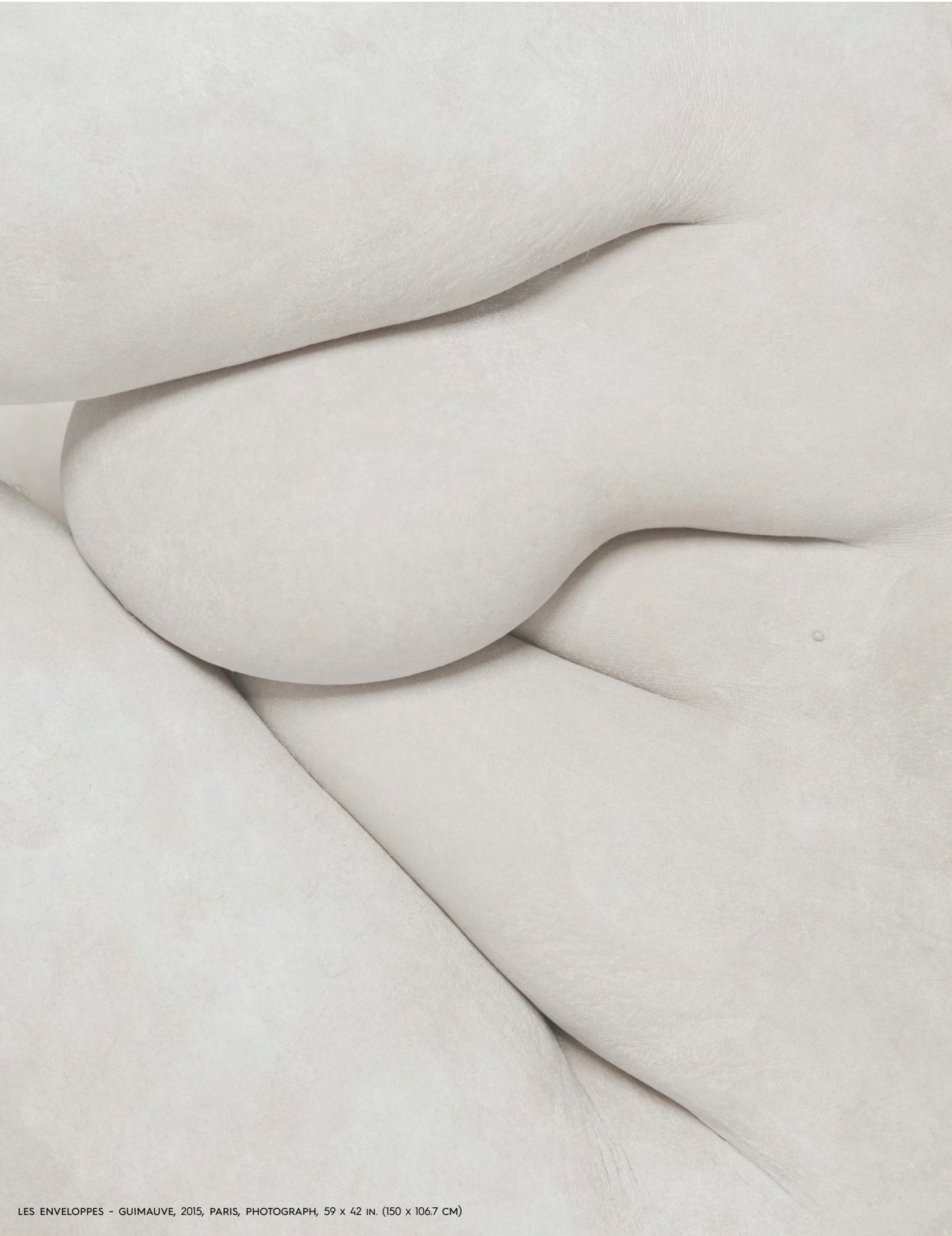
LES ENVELOPPES - GUIMAUVE, 2015, PARIS, PHOTOGRAPH, 59 x 42 IN. (150 x 106.7 CM)