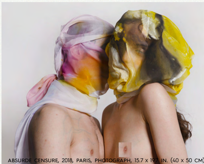
ABSURDE CENSURE, 2018, PARIS, PHOTOGRAPH, 15.7 x 19.7 IN. (40 x 50 CM)

"And even the person who thinks she is the ugliest or most insignificant could pose for me, so many people don't even know how beautiful they are."