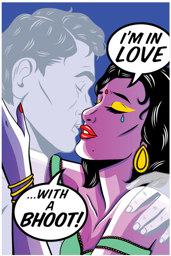
BHOOT, 2023, ACRYLIC ON CANVAS, 79 X 49 IN (200.7 X 124.5 CM)

"BLOODY PHOOL" is on display at Richard Taittinger Gallery through May 28<sup>th</sup> at 154 Ludlow Street. Select artworks and merchandise are available online for purchase at richardtaittinger.com.