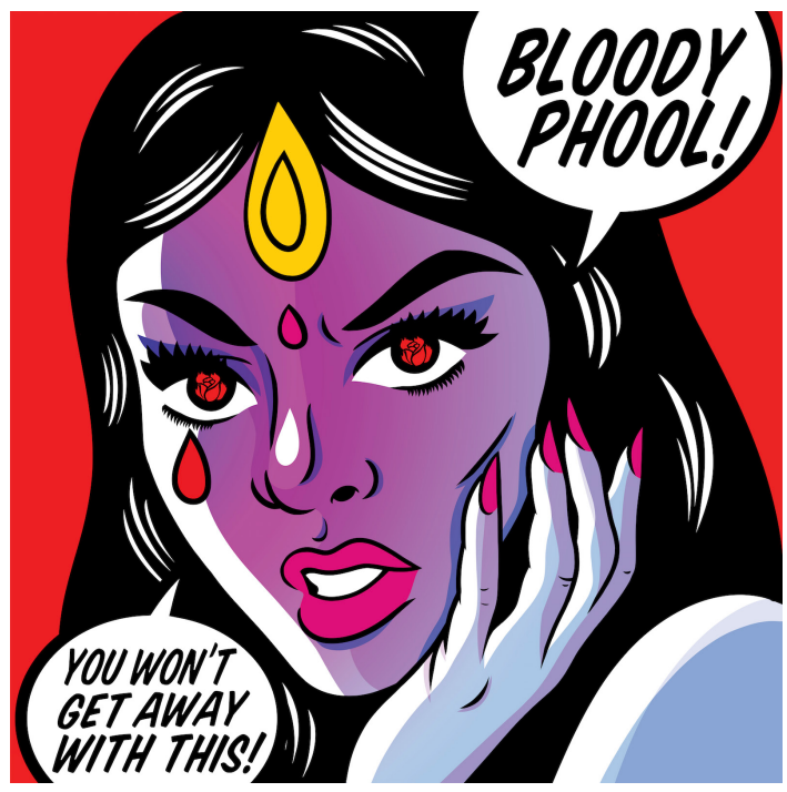
BLOODY PHOOL, 2023, ACRYLIC AND INK ON CANVAS, 49 X 49 IN (124.46H X 124.46W CM)

Building on her heritage and childhood, Qamar explores an awareness and understanding of the complex depiction of femininity and sexuality within Indian art forms. The inclusion of her works in tandem with Bollywood imagery reveals a tension between the fantasy and the reality. Thus, forming a rift between perceptions of women in relationships and the outcomes of deception and feminine rage.