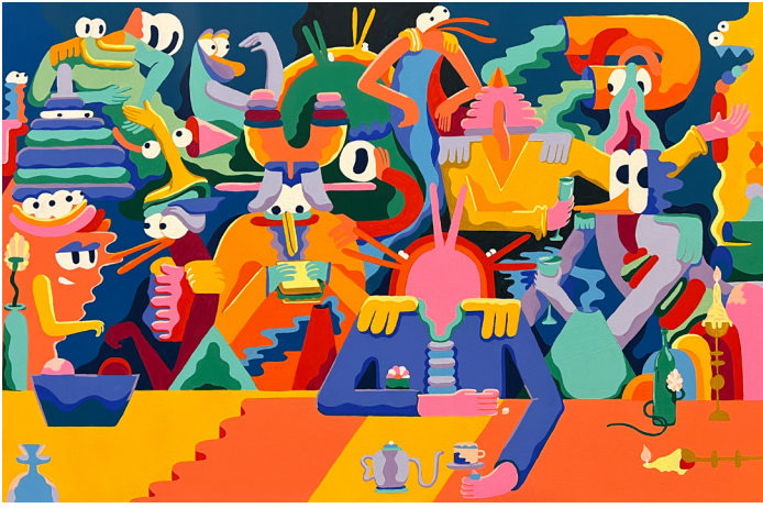
I Wasn't Kidding , 2024, Gouache on Canvas, 24 x 36 in. (60.96 x 91.44 cm.)